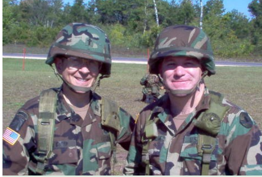
From A to Z!