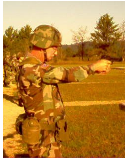
Marksman? Sharpshooter? Expert?