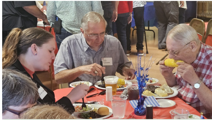
Too busy eating to smile for the camera!