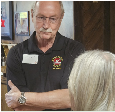
He does not look happy!