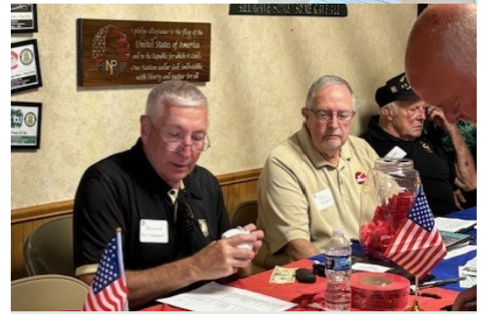
Greeted by smiling faces!