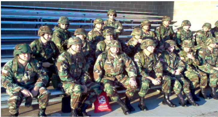
Hurry up and wait!